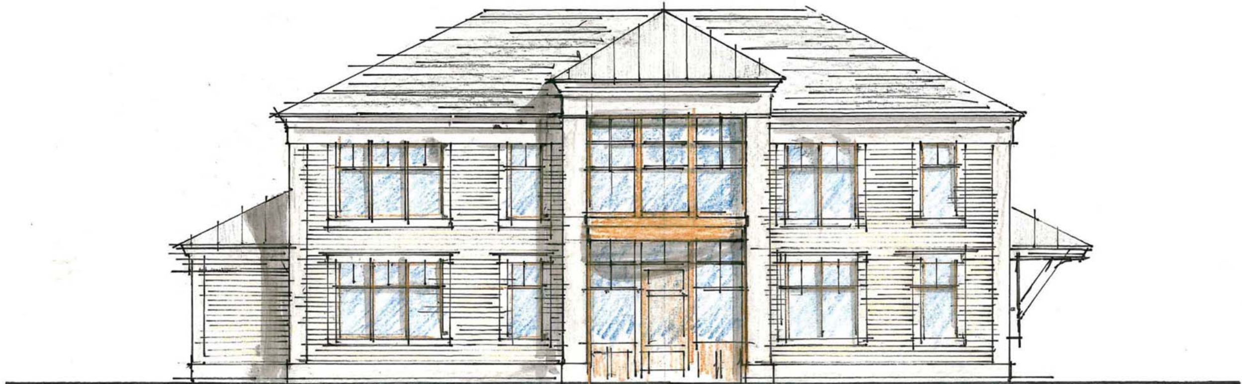
EAST ELEVATION OPTION 1 1/8"=1'-0"